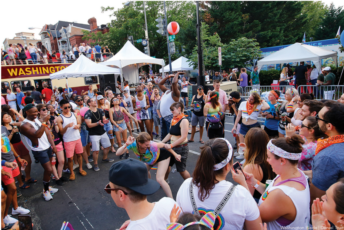
A scene from the Capital Pride Block Party in 2018.