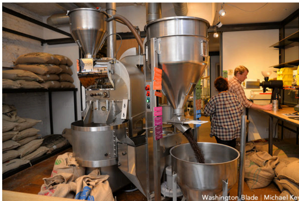
Compass Coffee