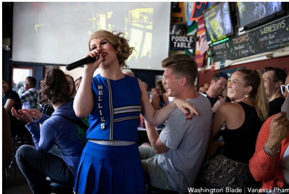
Nellie's Drag Brunch