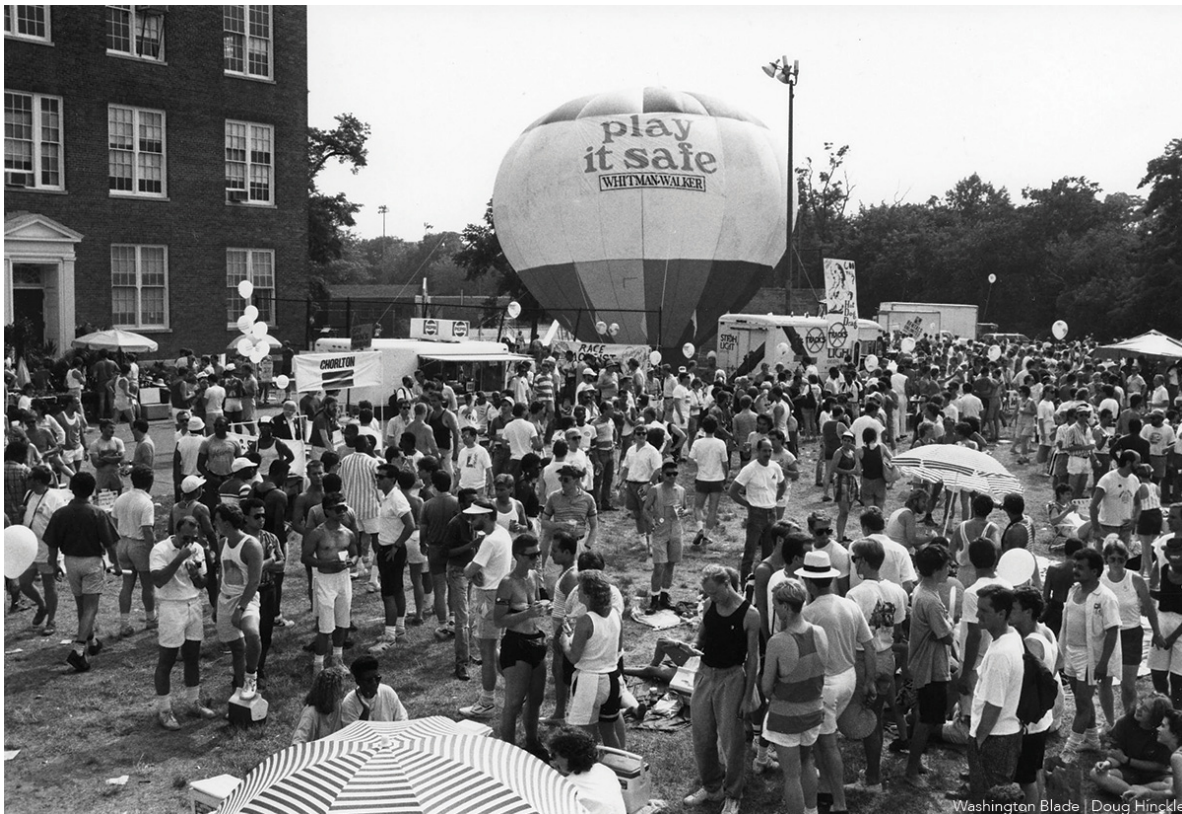
A scene from 1985 Gay and Lesbian Pride Day.