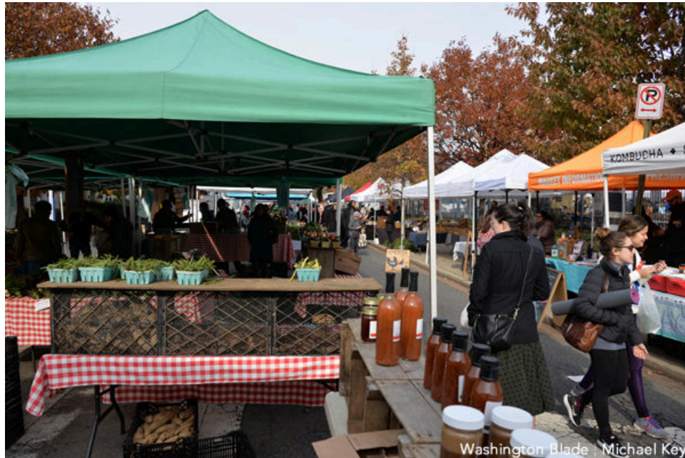
Dupont Circle Farmers Market

Second consecutive win! Sundays 8:30 a.m.-1:30 p.m. year round