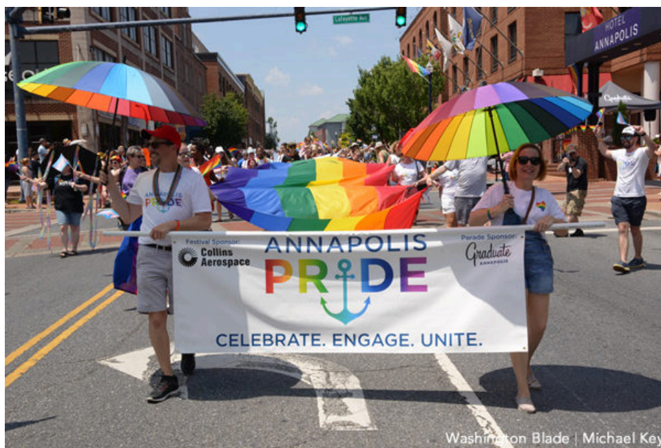
Annapolis Pride