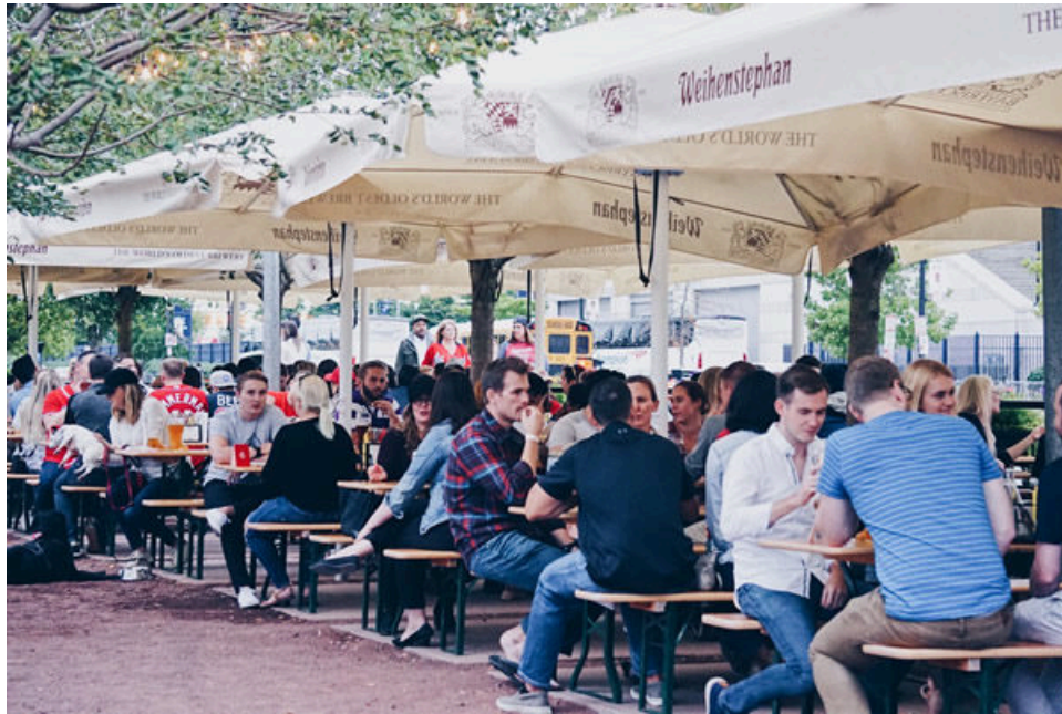
Dacha Navy Yard