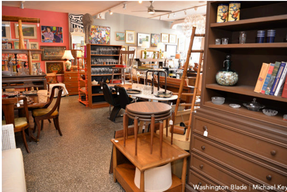
Miss Pixie's

A perennial favorite in this category! Same outcome for third consecutive year.