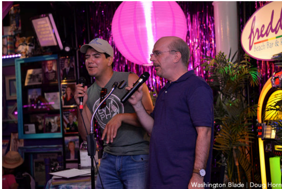
Freddie's Beach Bar