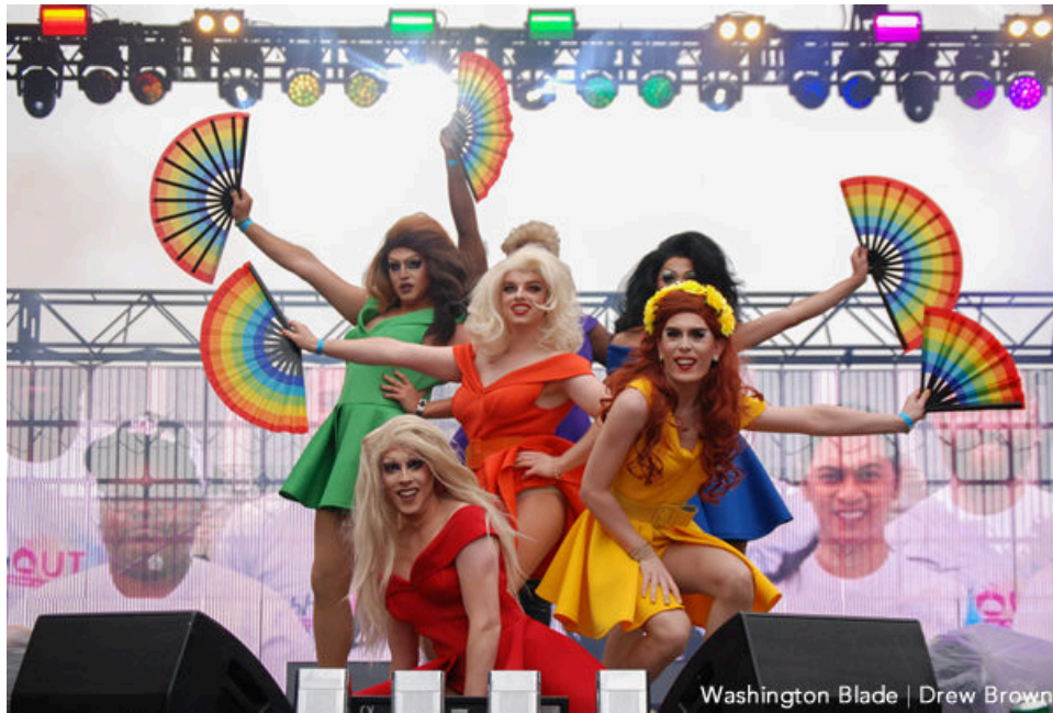
The main stage at the 2019 Capital Pride Festival