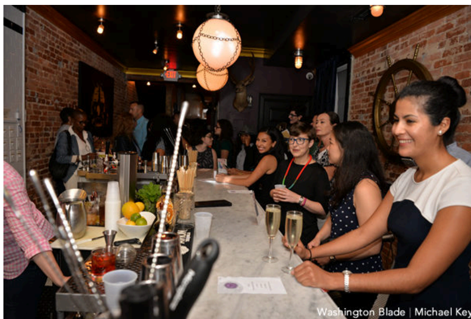
Hank's Cocktail Bar