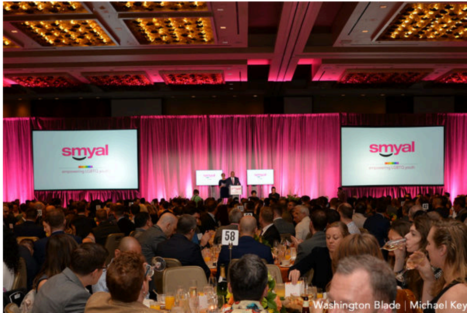
SMYAL Fall Brunch fundraiser

Supporting and Mentoring Youth Advocates and Leaders. Second consecutive win!