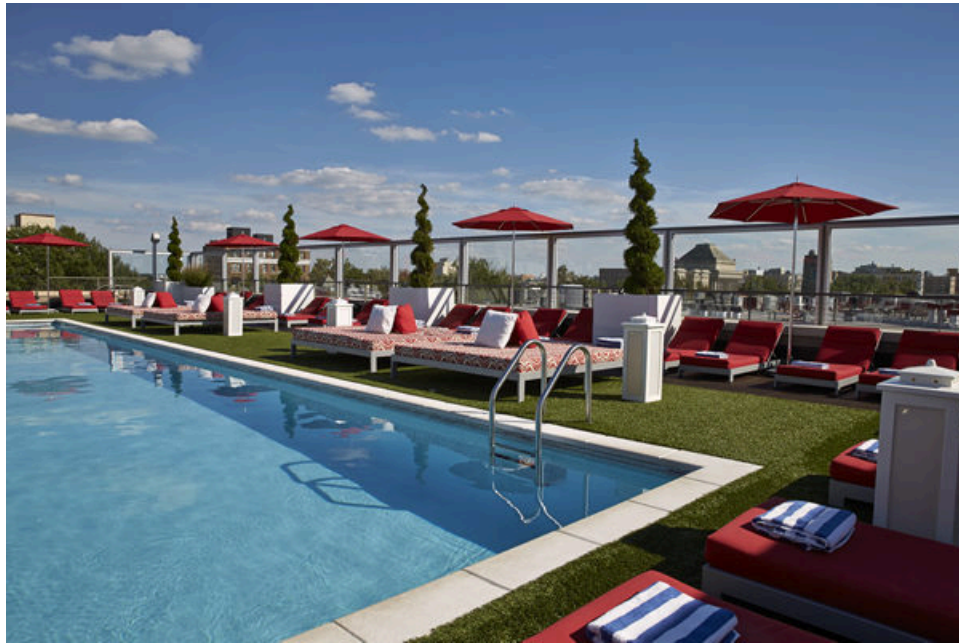
VIDA Penthouse Pool