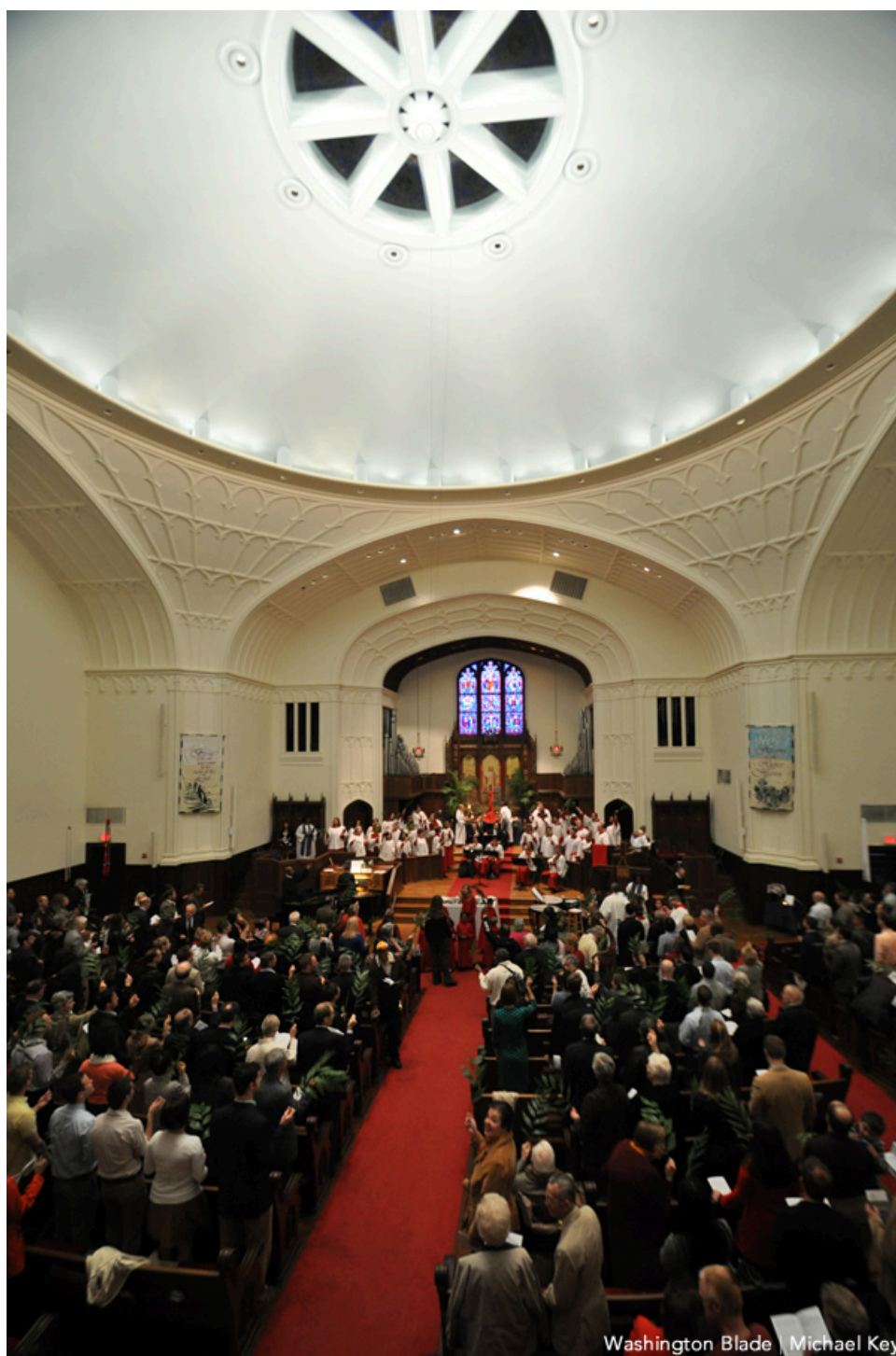
Foundry United Methodist Church

Foundry fights back! Dethrones Empowerment Liberation Cathedral, which had four consecutive wins (2015-2018). Foundry (church home to 17 U.S. presidents) held the title 2011-2014 was last year's editor's choice.