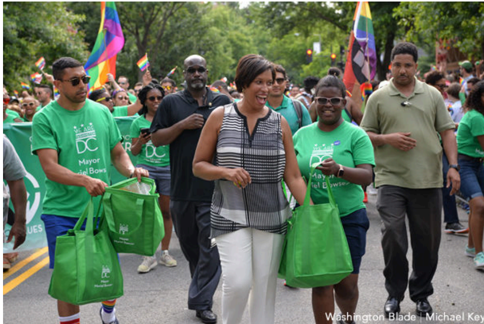
Mayor Muriel Bowser