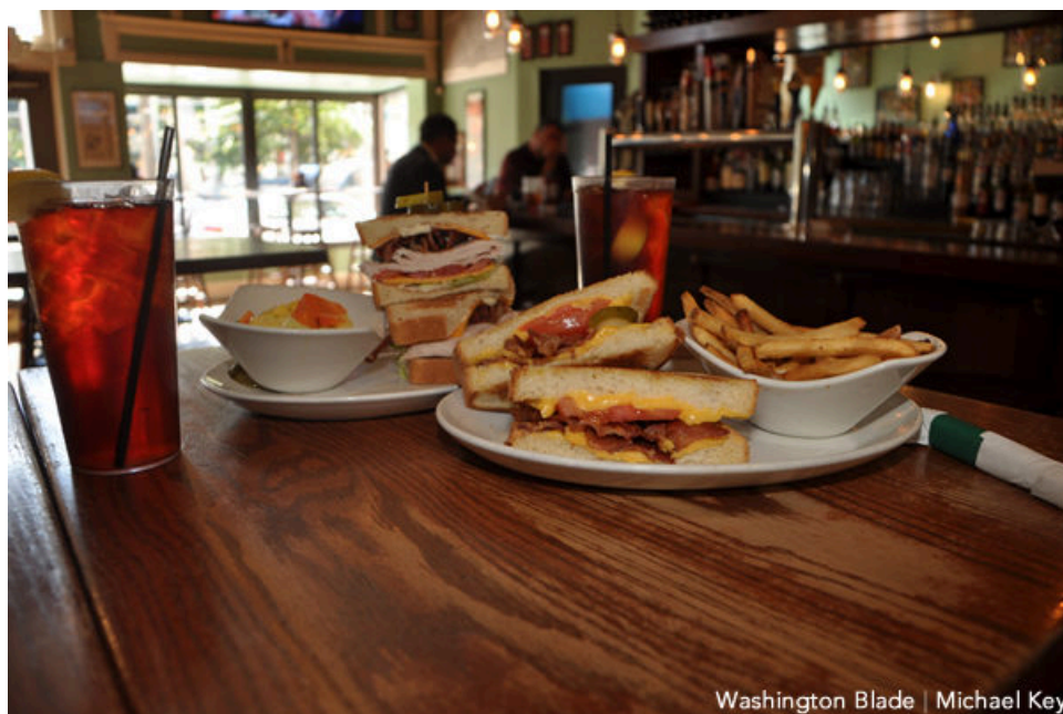
Stoney's