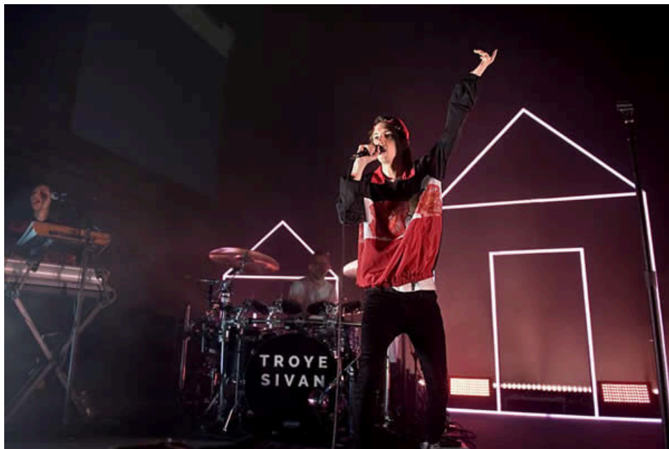
9:30 Club

A perennial dominator — whopping 14th consecutive win in this category! Won every year since 2006 (plus 2002 and 2003 — every time the category has been included).