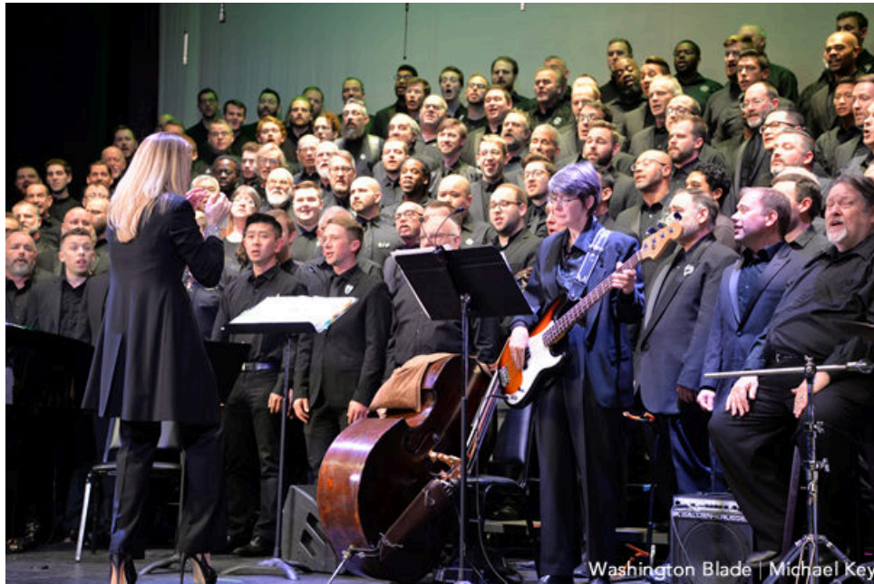
Gay Men's Chorus of Washington

Their show "Coulda, Woulda, Shoulda" is Saturday night (5 and 8 p.m.) at City Winery. The chorus knocks off Stonewall Sports after two consecutive wins.