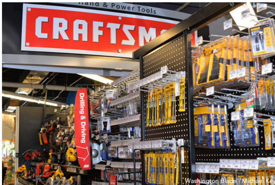
Logan Ace Hardware

A perennial favorite in this category. Third consecutive win!