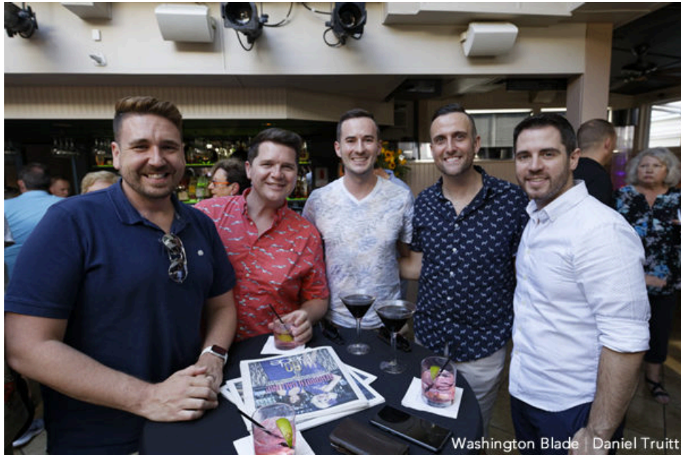
Blue Moon