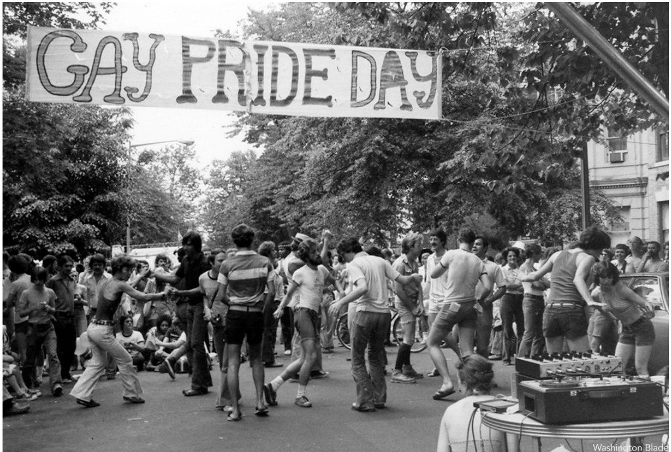
Gay Pride Day 1976

To celebrate the 50th anniversary of LGBTQ Pride in Washington, D.C., the Washington Blade team combed our archives and put together a glossy magazine showcasing five decades of celebrations in the city. Below is a sampling of images from the magazine but be sure to find a print copy starting this week.