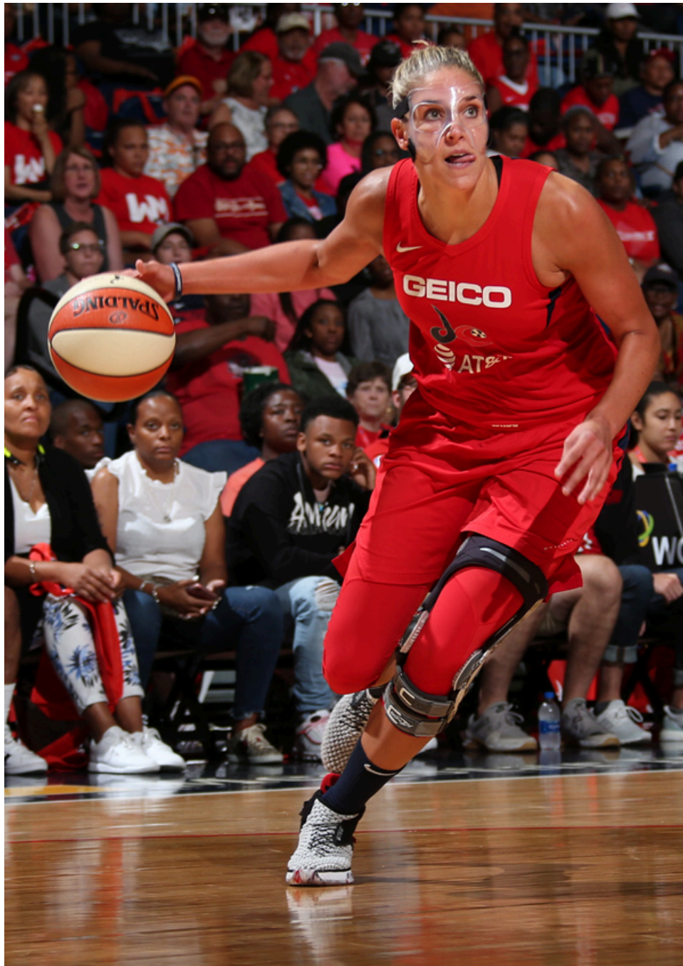
Elena Delle Donne