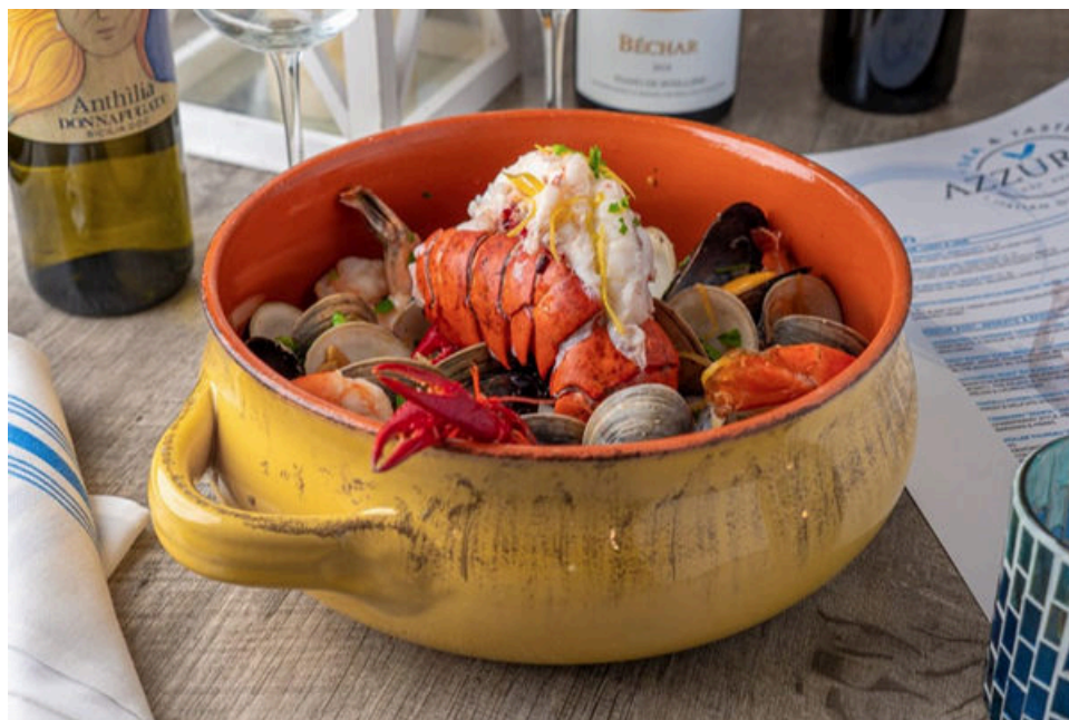
Cacciucco Alla Livornese at Azzurro