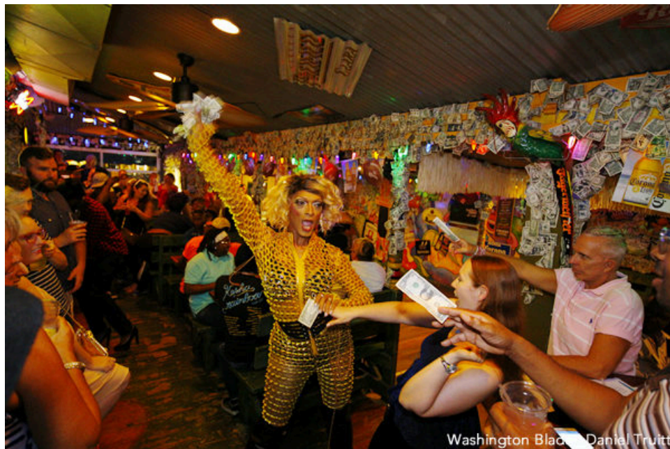
Purple Parrot