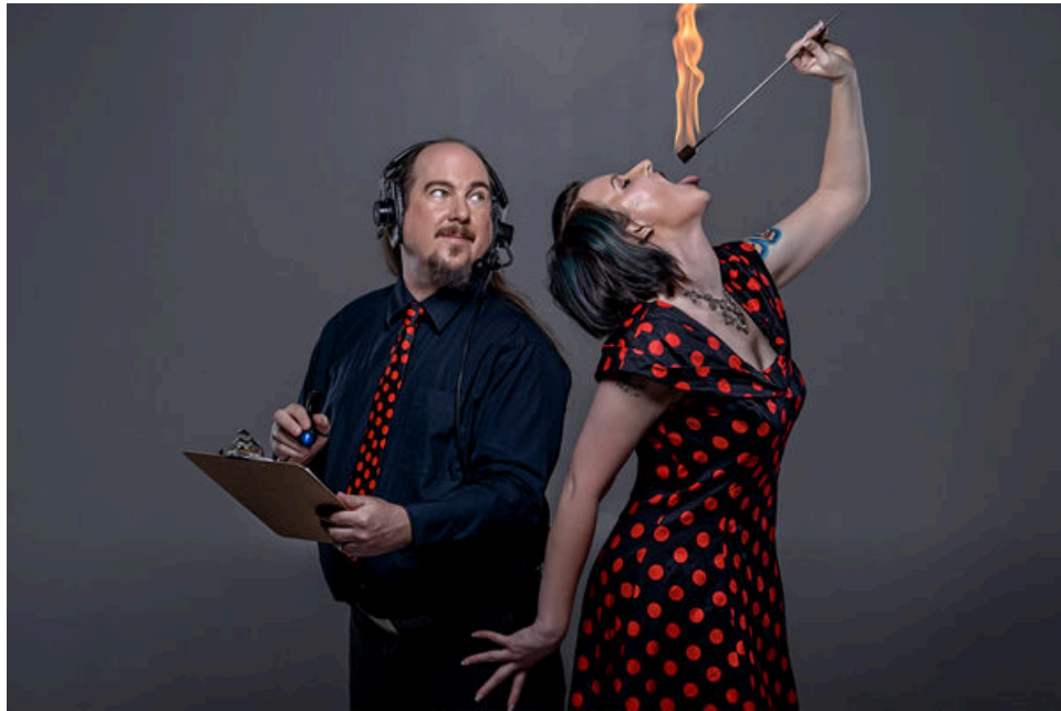
D.C. Weirdo Show