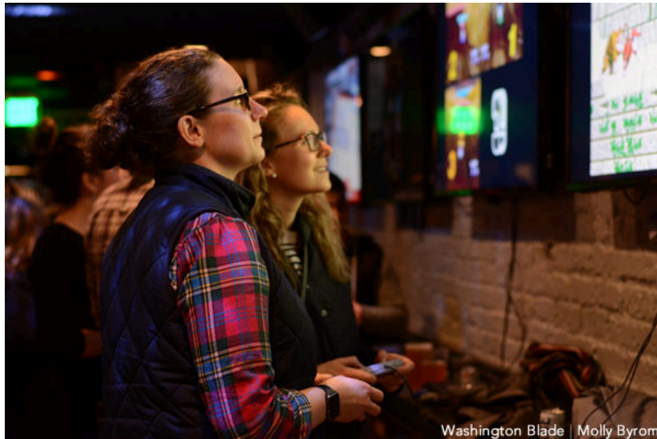
A League of Her Own

Second consecutive win in this category!