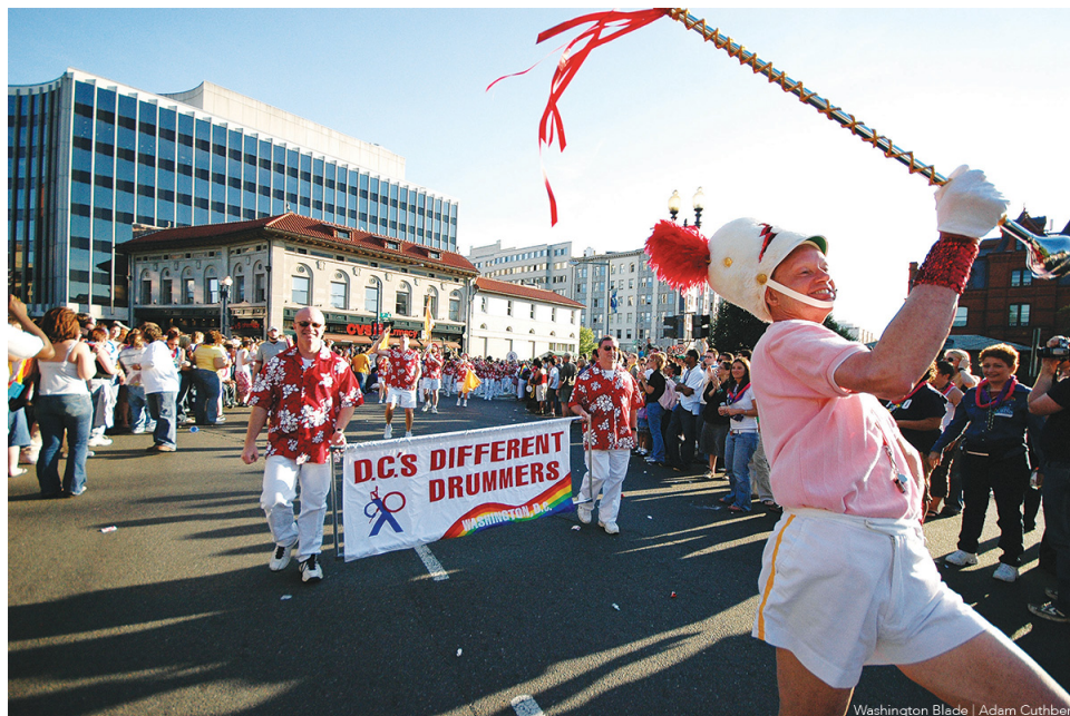
D.C.'s Different Drummers march in the 2006 Capital Pride Parade.

To celebrate the 50th anniversary of LGBTQ Pride in Washington, D.C., the Washington Blade team combed our archives and put together a glossy magazine showcasing five decades of celebrations in the city. Below is a sampling of images from the magazine but be sure to find a print copy starting this week.