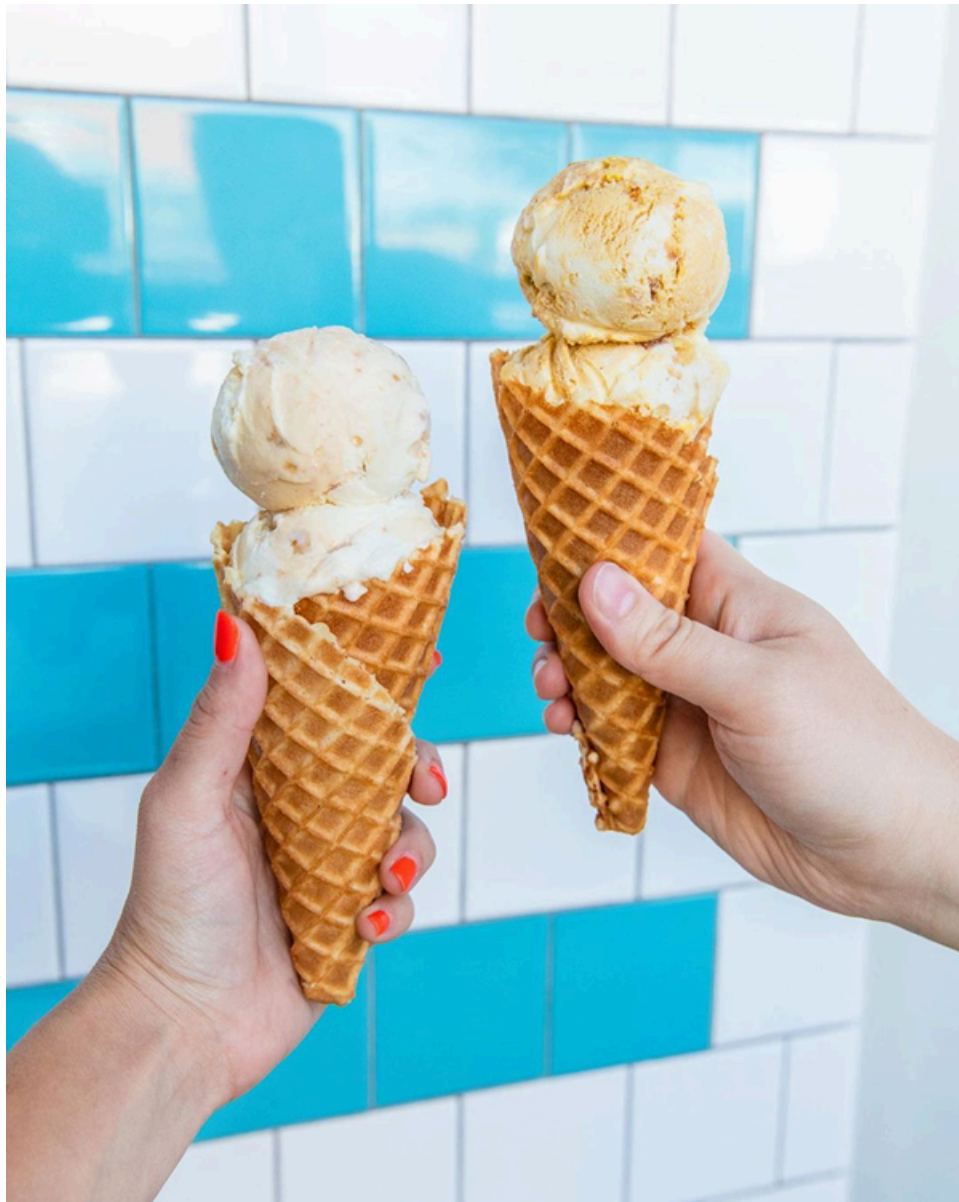
Jeni's Splendid Ice Creams