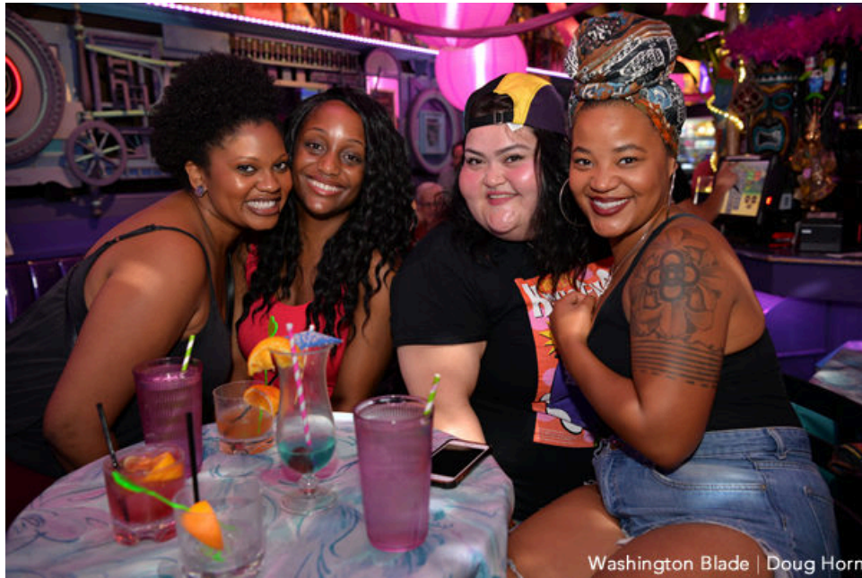
Freddie's Beach Bar

Extending their record! — with this win and the Best Karaoke win, that makes 23 wins for this Best of Gay D.C. favorite. Freddie's has won this award every year since 2002 in addition to several others. It's a Best of Gay D.C. all-time record for a single category.