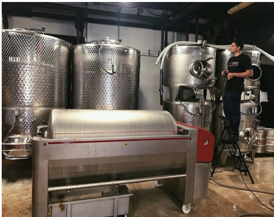
City Winery

Second year for both winner and editor's choice!