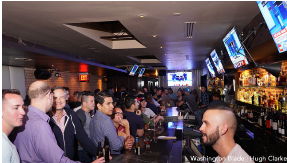
Number Nine

A Blade "Best Of" ping-pong game — A repeat of the 2017 outcome after flip-flopping last year!