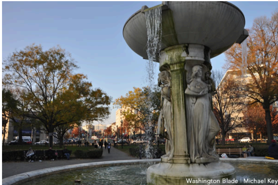
Dupont Circle

Shaw is dethroned after three consecutive wins! Logan was also the 2016 runner up.