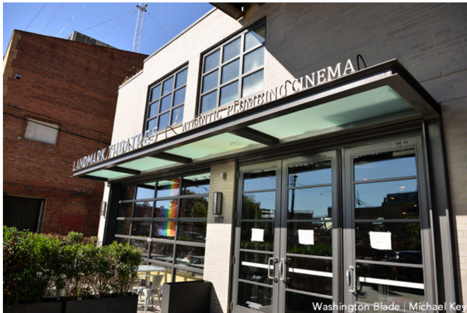
Landmark's Atlantic Plumbing Cinema