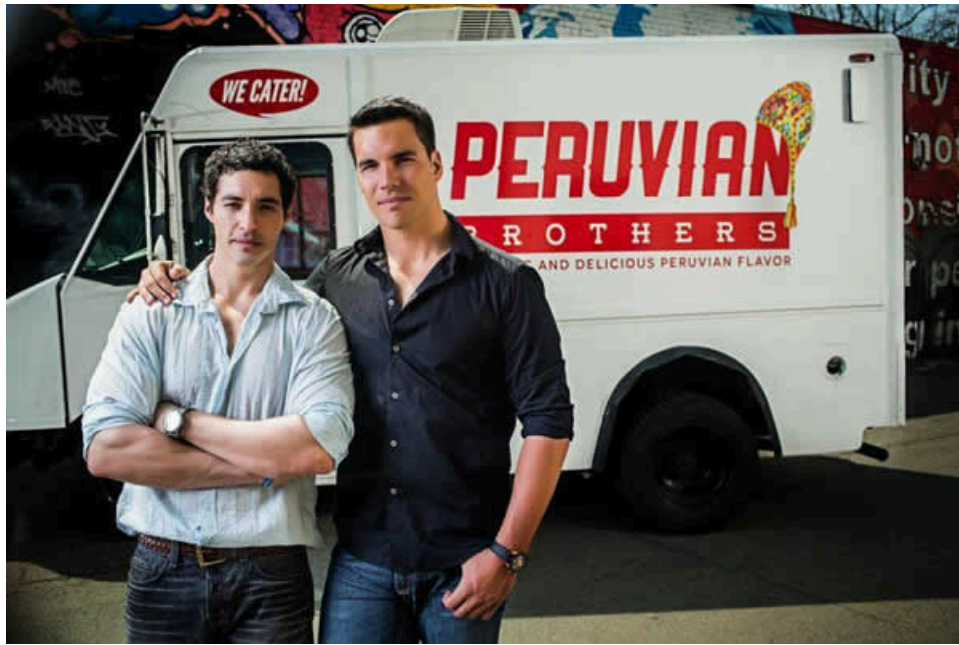
Peruvian Brothers