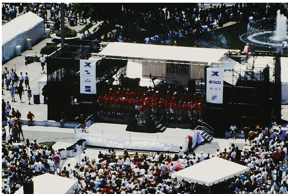
The 1995 Lesbian and Gay Freedom Festival was held on Freedom Plaza on June 18.