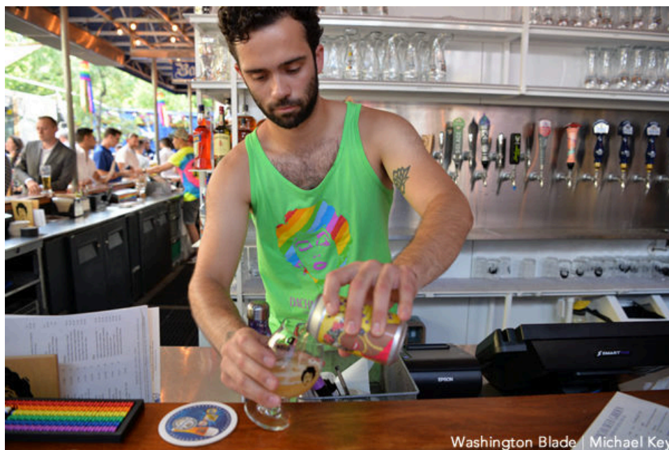
Dacha Beer Garden