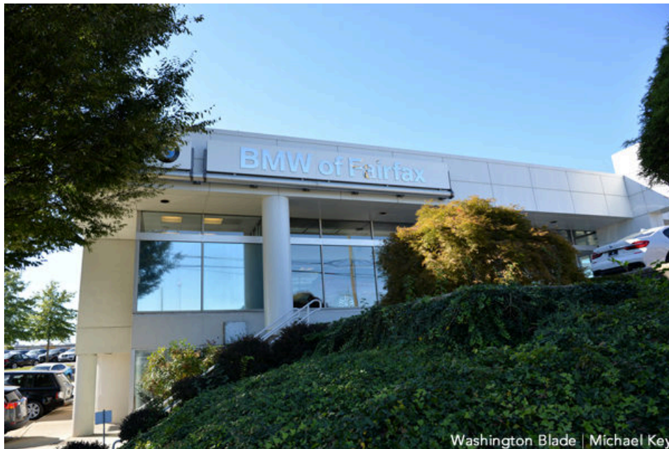
BMW of Fairfax