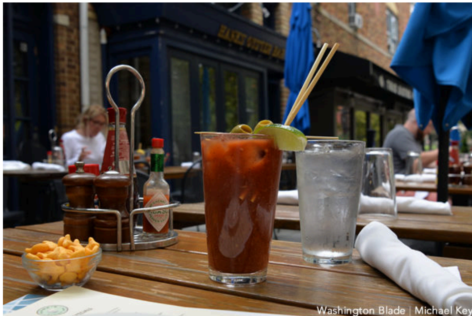
Bloody Mary at Hank's Oyster Bar in Dupont