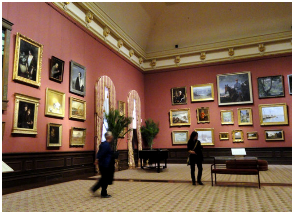
Renwick Gallery

A repeat of last year's outcome for both winner and editor's choice.