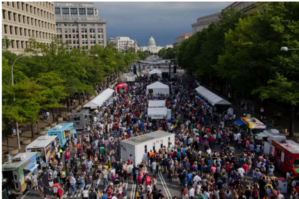
Taste of D.C.

"Largest culinary festival in the mid-Atlantic." Runs Oct. 26-27.