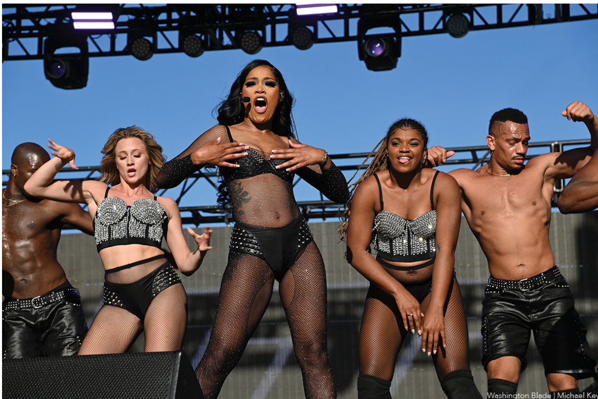
Keke Palmer performs at the 2024 Capital Pride Festival.