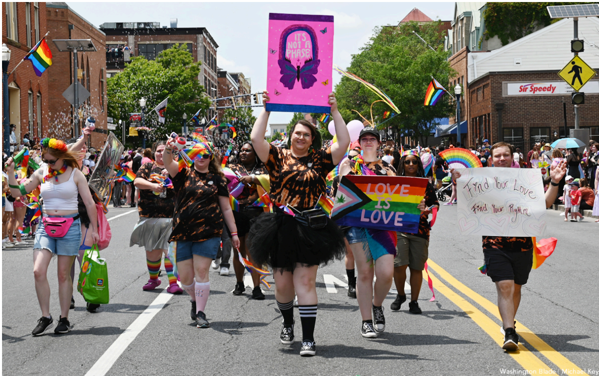
Annapolis Pride

For the second year in a row, Annapolis Pride wins best Pride outside of D.C. Founded in the spring of 2018, a group of Annapolis locals decided it was about time the city had its own Pride event, just like Baltimore and D.C. Its first festival officially kicked off in 2019 and attracted more than 6,000 attendees. The city will celebrate its fourth Annapolis Pride Parade and Festival in June 2024.