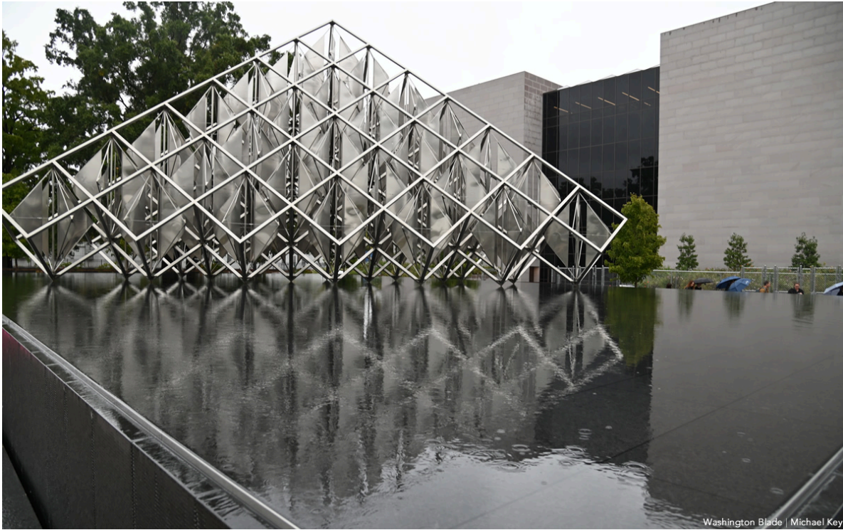
National Air and Space Museum

The National Air & Space Museum is a favorite for tourists and locals alike. Complete with a planetarium, an Imax theater, numerous exhibits, and frequent events, there's something for everyone.