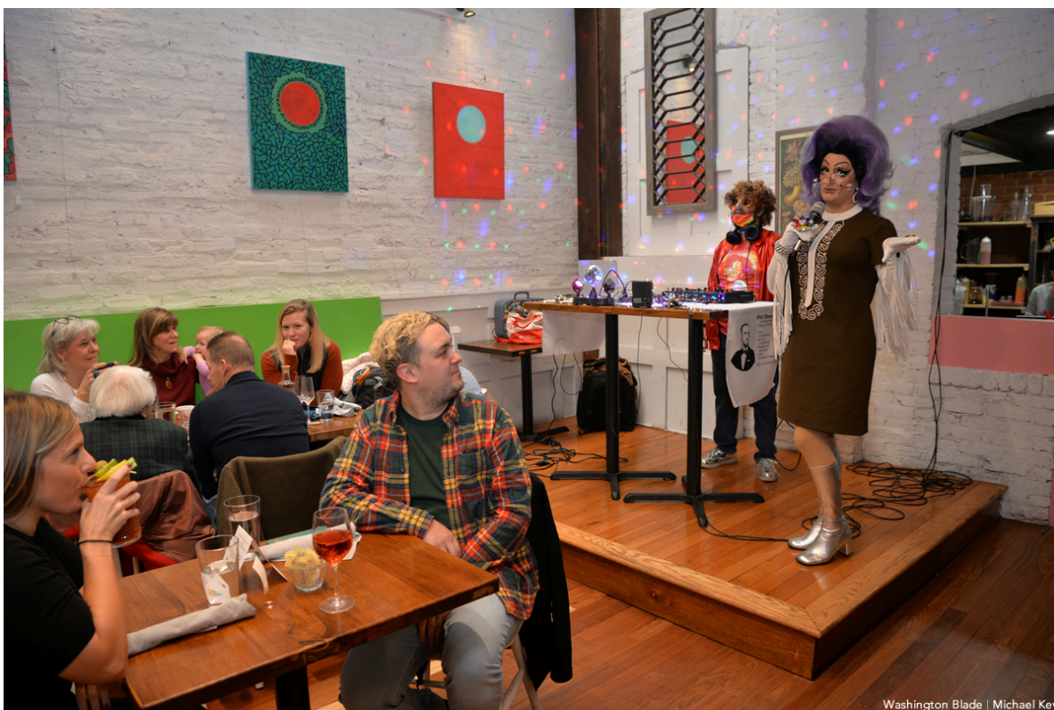
Crazy Aunt Helen's