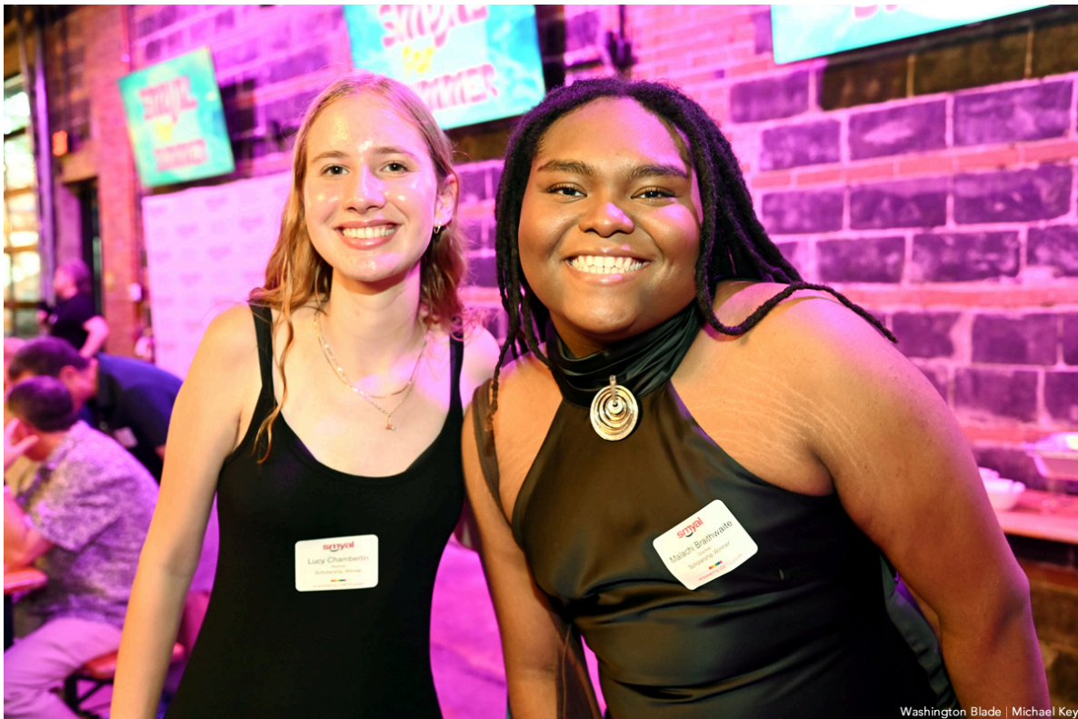
Two scholarship recipients attend the SMYAL For Summer event at Hook Hall.

Last year's Editor's Choice, SMYAL, takes the crown for 2023's Best Non-Profit. SMYAL is an organization dedicated to LGBTQ equality and opportunity. It provides counseling services, development opportunities, and after-school programs for LGBTQ youth.