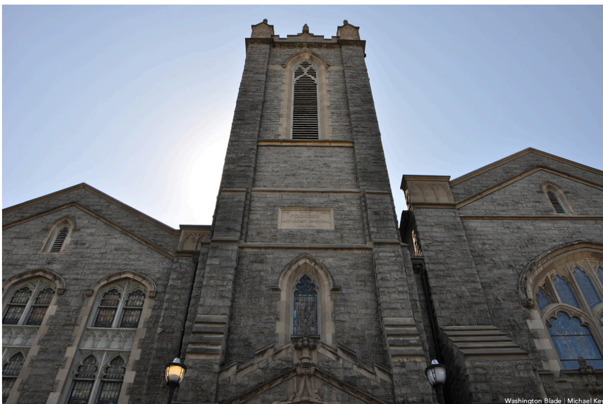
Foundry United Methodist Church

For LGBTQ people of faith, finding a supportive community can be challenging. The Foundry United Methodist Church is an inclusive, Christian community that is welcoming to all. As stated on its website, some of its strongest values are a devotion to diversity and that they honor humans just as they honor divinity.