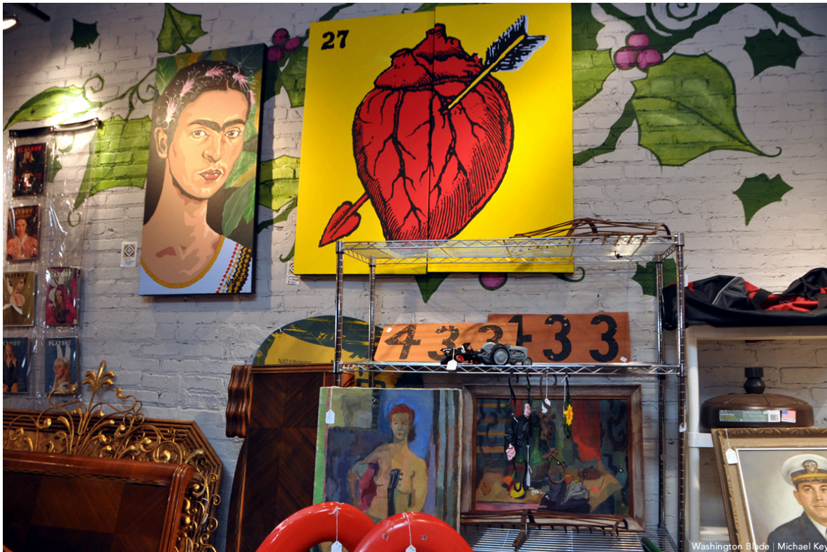
Miss Pixie's

Miss Pixie's, returning as winner of Best Home Furnishings for the third year in a row, sells vintage furniture and decor perfect for any queer home. They have everything you could need, including chairs, tables, bookshelves, dressers, mirrors, and "whatnots," which includes dishware, photos, books, magazines, and even bottle caps. Miss Pixie's diverse catalogue has a wide range of colors, shapes, and sizes so everyone can find something perfect for them.