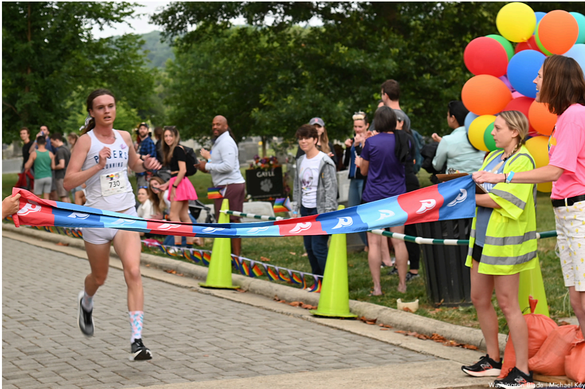
The D.C. Front Runners Pride Run 5K

For sporty queers looking for an athletic club and place to socialize, the DC Front Runners has become home to many. The DC Front Runners are the local chapter of the International Front Runners, a welcoming club for runners and walkers alike for 40 years.