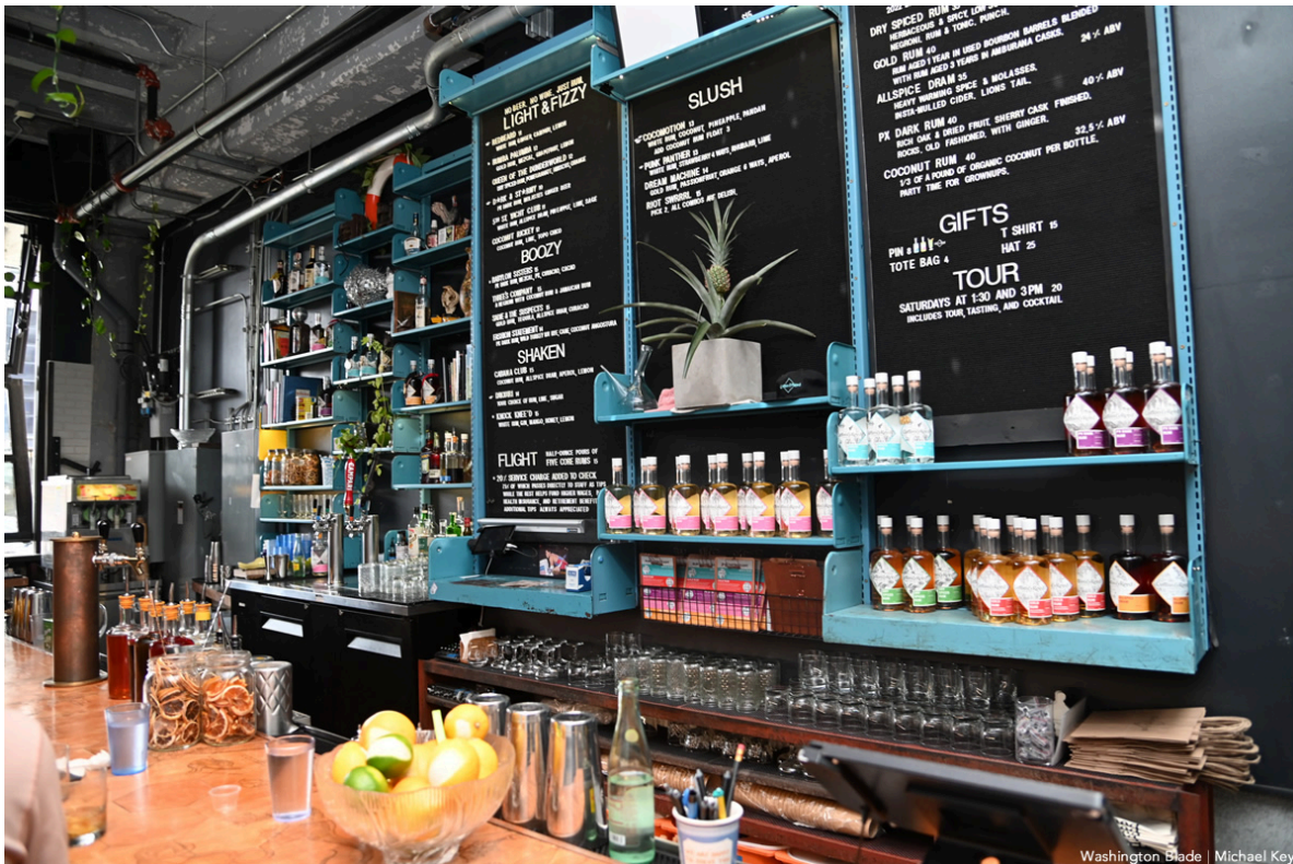
Cotton & Reed