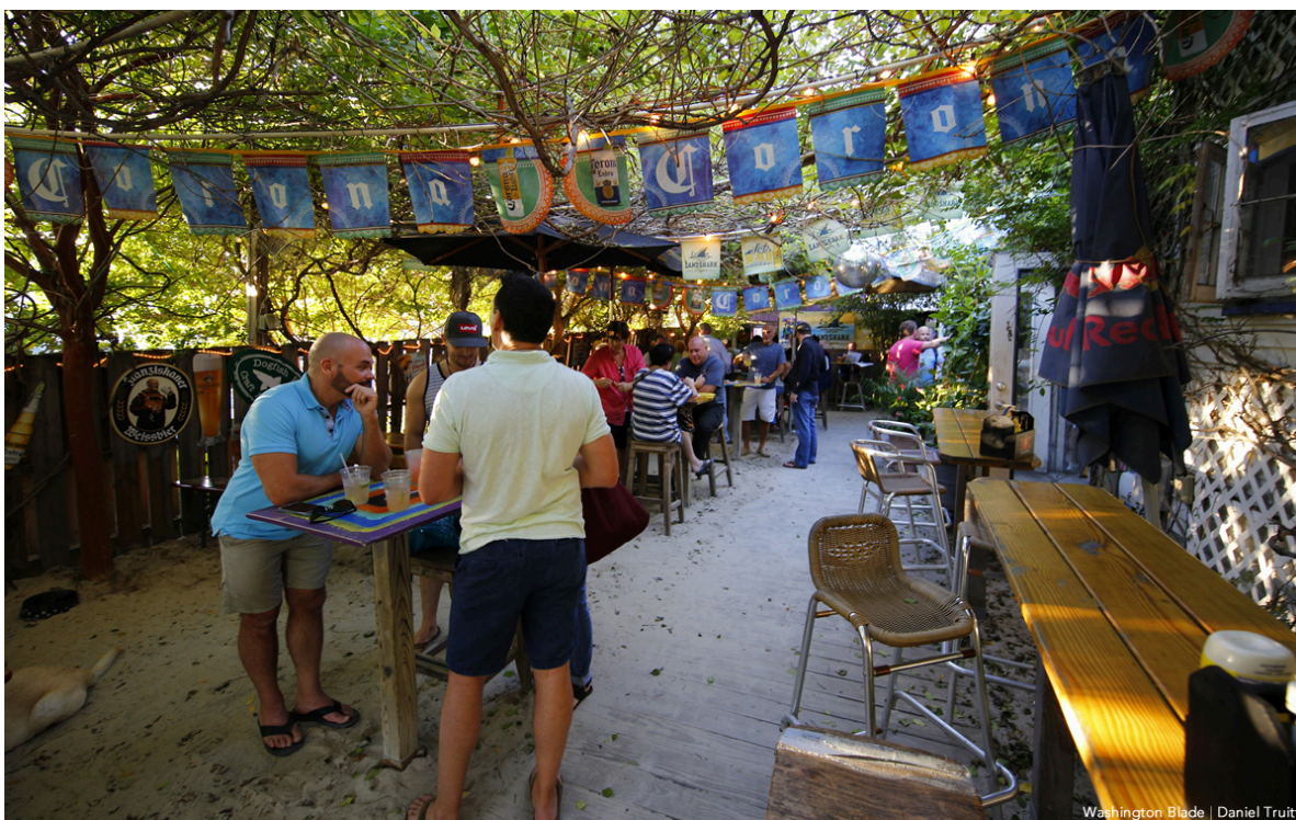
Purple Parrot