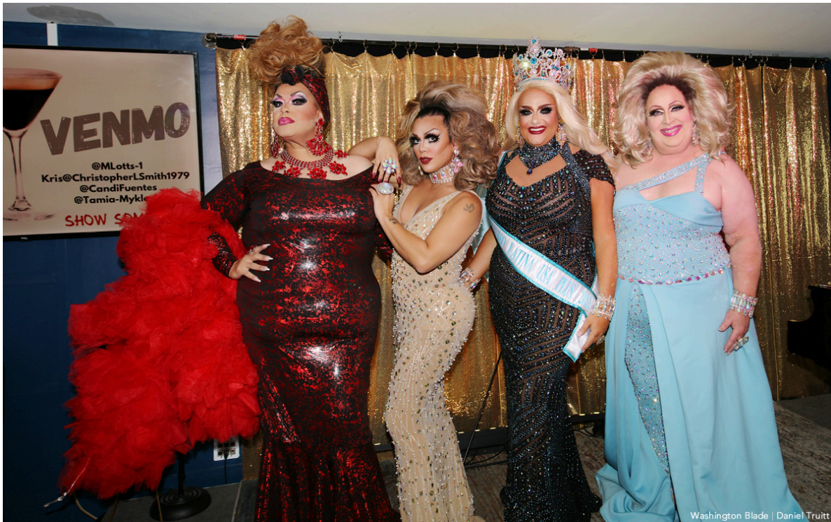
Drag Brunch at the Pines