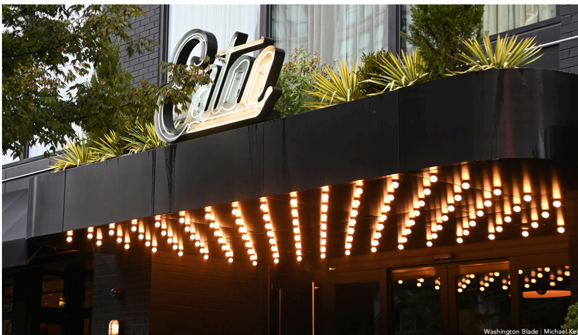
Eaton DC

Eaton DC, a returning winner in this category, is described as beyond a hotel for tourists. According to its website, “Eaton exists at the nexus of hospitality, impact, culture, and wellness.”