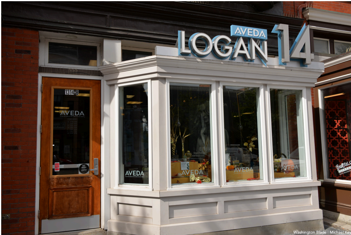
Logan 14

This year marks Logan 14's eighth consecutive win on the Blade's Best Of. With roughly 75% of the business's clientele being LGBTQ, this is their first win in this category.