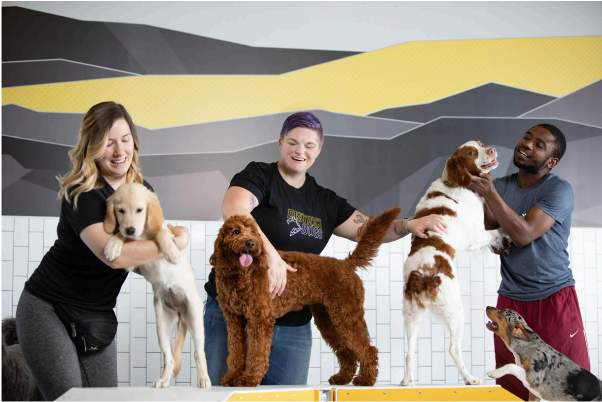
District Dogs