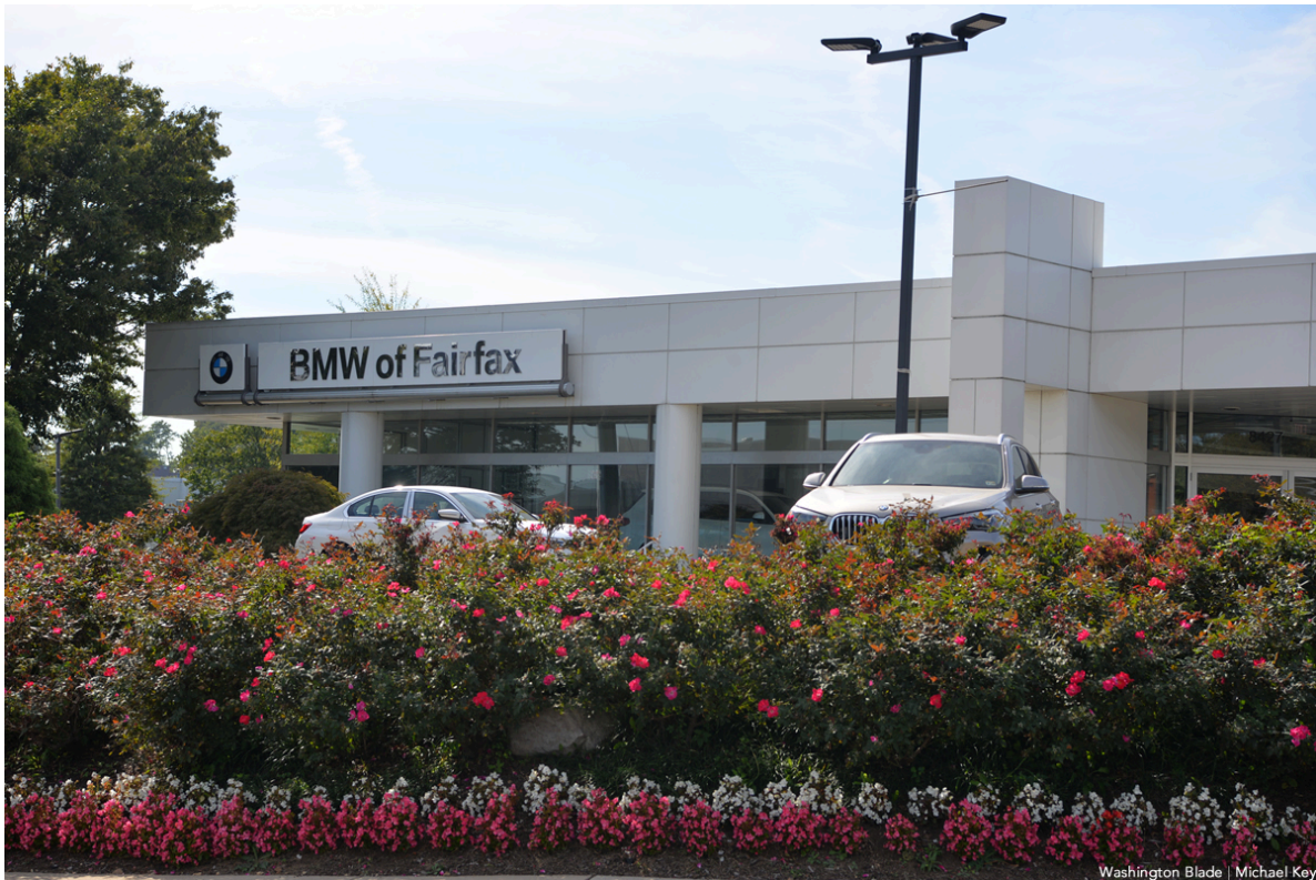
BMW of Fairfax