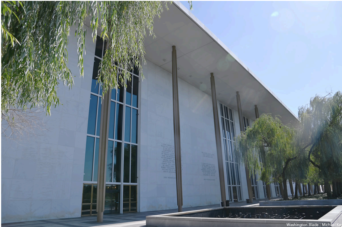
The Kennedy Center

What's lovingly called the big white box on the river has been selected as our readers' favorite. The historic Kennedy Center has it all including symphony, dance, Broadway shows, and specifically queer-made shows like "The Night Garden: A Sartorial Celebration" on Oct. 25.