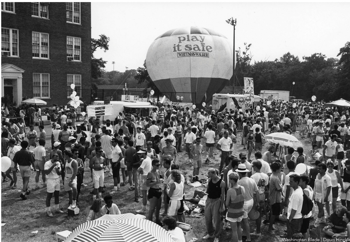
A scene from 1985 Gay and Lesbian Pride Day.