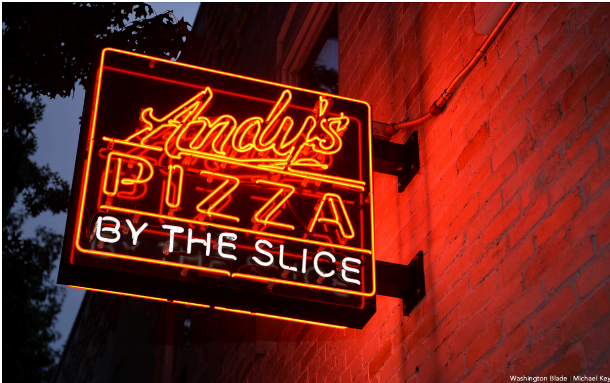
Andy's Pizza

In the New York tradition, Andy's Pizza serves up pizza from stone deck ovens made of long-fermented dough, Wisconsin mozzarella, and California tomatoes. Andy's boasts seven spots across the area, including one in Shaw near popular bars Dirty Goose, Kiki, and Shakers.