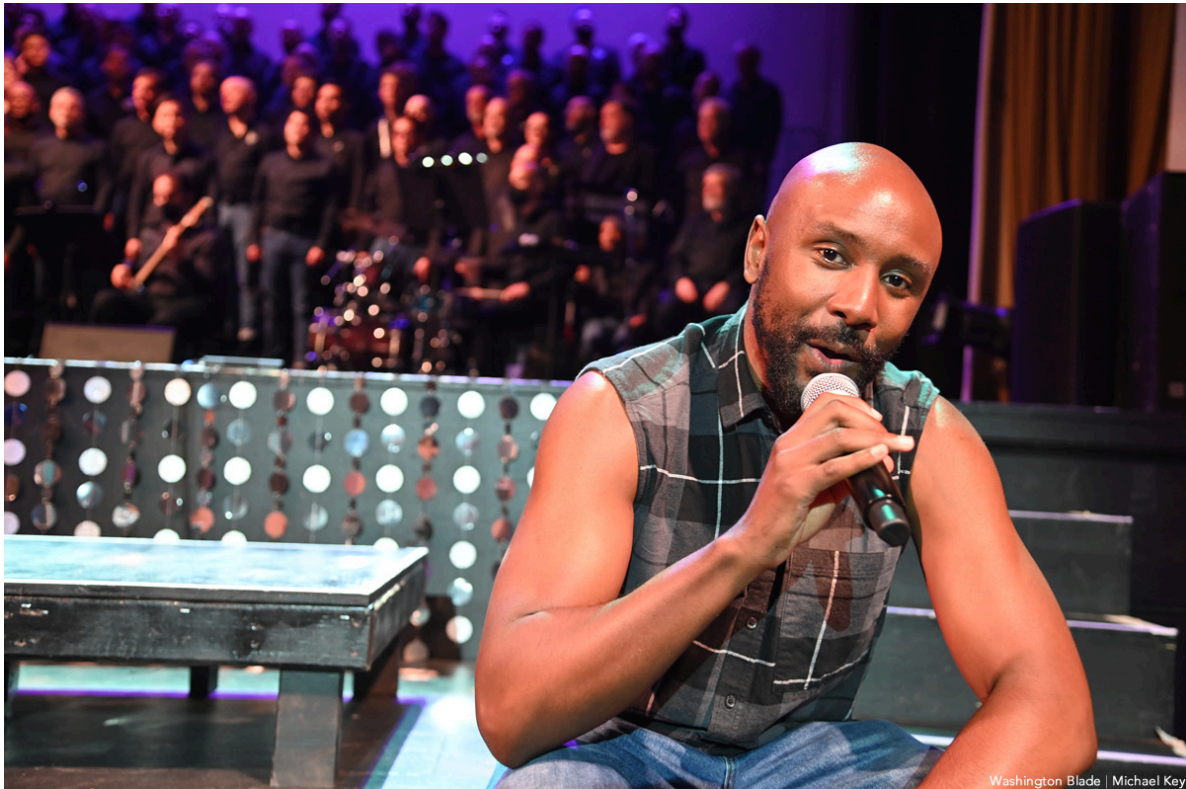
The Gay Men's Chorus of Washington performs 'Dolly' at the Lincoln Theater last June.

A repeat winner in this category, the Gay Men's Chorus of Washington calls itself the "voice of equality of the nation's capital," and with an annual audience of 100,000+, many would agree. The GMCW entertains, inspires, and advocates through music. They have toured nationwide and been featured on the "Today" show. Their next show in D.C. will be the Holiday Show on Dec. 9.