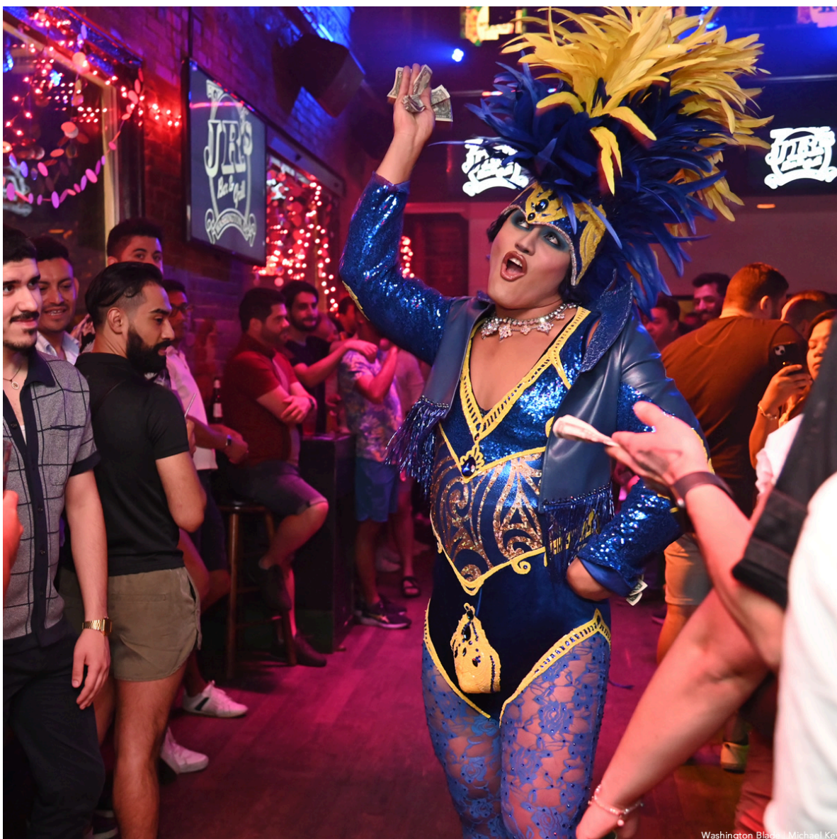
Con Acento

Since 1986, JR.'s has been serving some of the city's best cocktails. And it hasn't lost its touch when it comes to invigorating dance parties. Con Acento, a Latinx monthly dance party, features the hottest hits that'll have hips swaying and hands elegantly slicing the air.