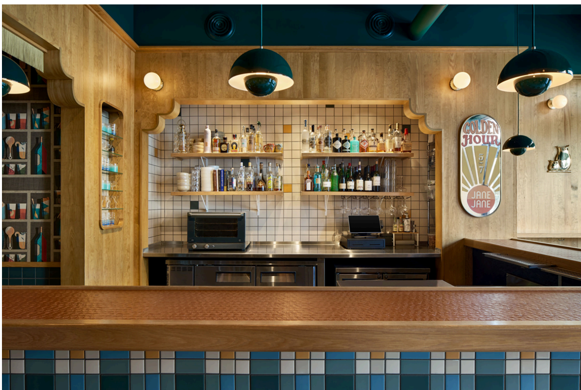
Jane Jane

Jane Jane is a local restaurant and bar with a wide variety of cocktails, beers, wines, as well as a non-alcoholic menu for under-21s. Unique house features include “Classified Documents,” “Gin Soaked Felon,” “Seasonal Affective Delight,” and more. Jane Jane is also a participant in D.C.’s annual Taste of Pride, among other local restaurants.