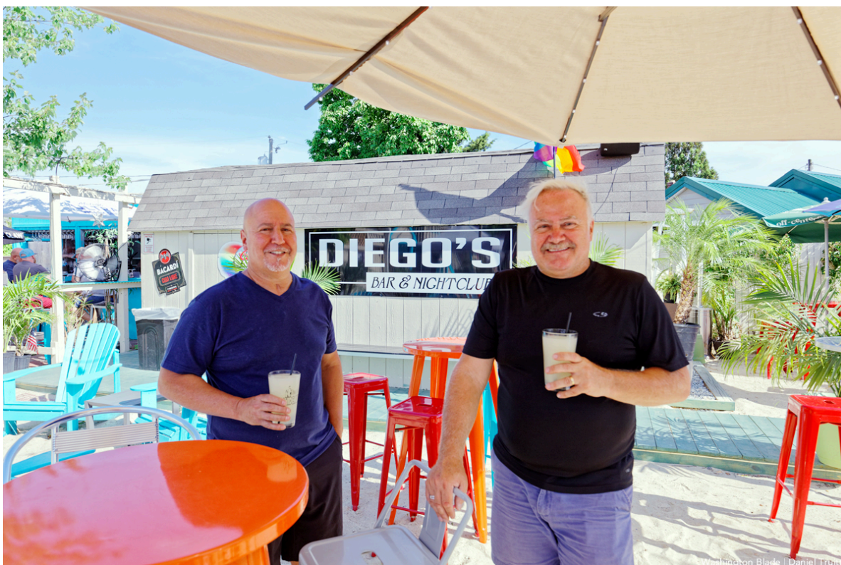
Diego's Bar & Nightclub

This is the third consecutive win for Diego's in this category and evidence of the enduring appeal and staying power of this favorite destination for tourists and locals alike. Whether you're looking for a laid back happy hour with friends or a sweaty, packed dance party, you'll find it at Diego's, which is also home to an array of live entertainment and drag shows. The spacious and comfortable outdoor bar is simply one of the town's greatest pleasures. Rehoboth could use more outdoor spaces like this.