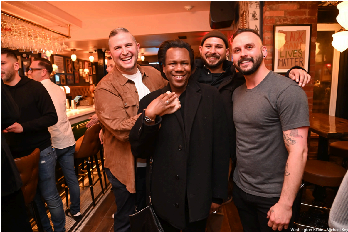
The Little Gay Pub

Despite being one of the newest gay bars on the block, Little Gay Pub has proven that it's on its way to becoming a mainstay in the city. Besides winning this award in its first year in business, the bar has made a name for itself, welcoming elite patrons, including former House Speaker Nancy Pelosi, who reportedly ordered a club soda before taking a bathroom selfie.