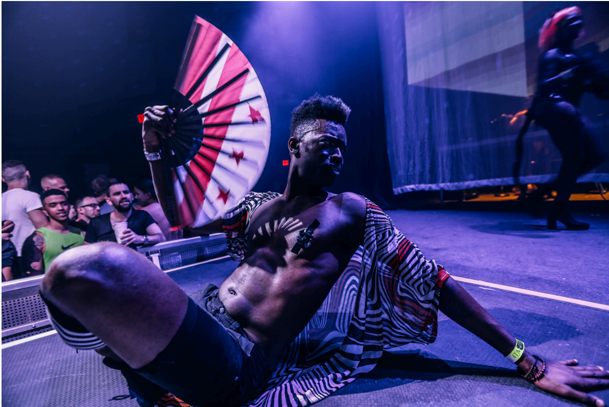
9:30 Club

The venerable and great 9:30 club wins again.