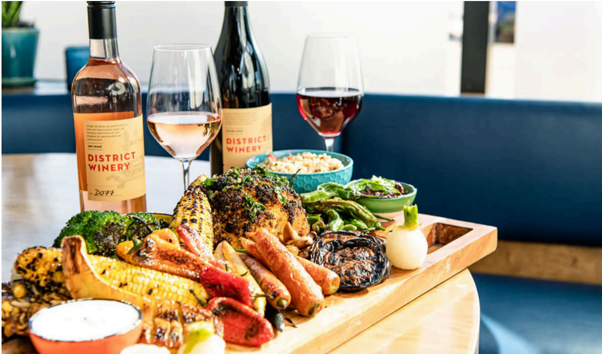
District Winery

District Winery describes itself as a modern, wine-focused, globally minded restaurant and bar on the ground floor of a working winery. The Blade's readers clearly have embraced the concept, voting it the city's best.