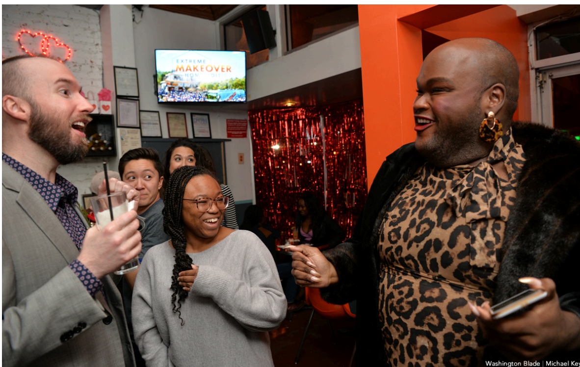
Duplex Diner

What better place to cure your Sunday hangover than at Duplex Diner where the menu features hearty food options like a Belgian waffle that comes with fresh berries and whipped cream or the buttermilk biscuit oozing with sausage gravy? Duplex Diner is the place where you can “come pull up a chair” and enjoy the simplest of moments with friends and family.