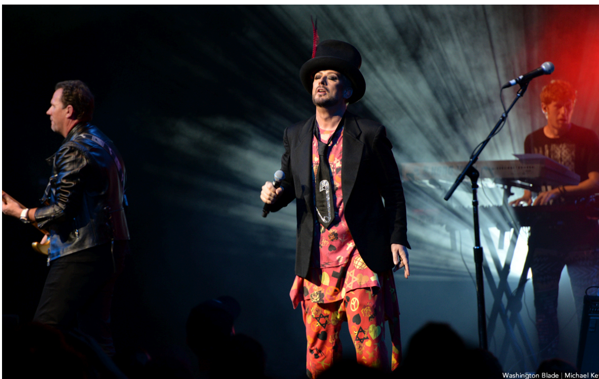
The Culture Club performs at Wolf Trap

For music alfresco, Wolf Trap continues to reign supreme with readers.