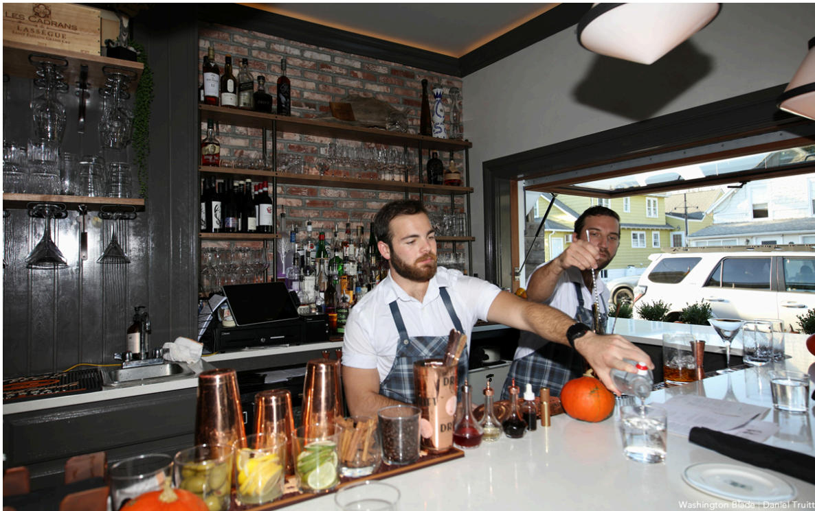
Drift

Drift took Rehoboth by storm this year with its inventive seafood-centric menu (the lobster French toast is a must) and scored a well-deserved rave review in the Washington Post.