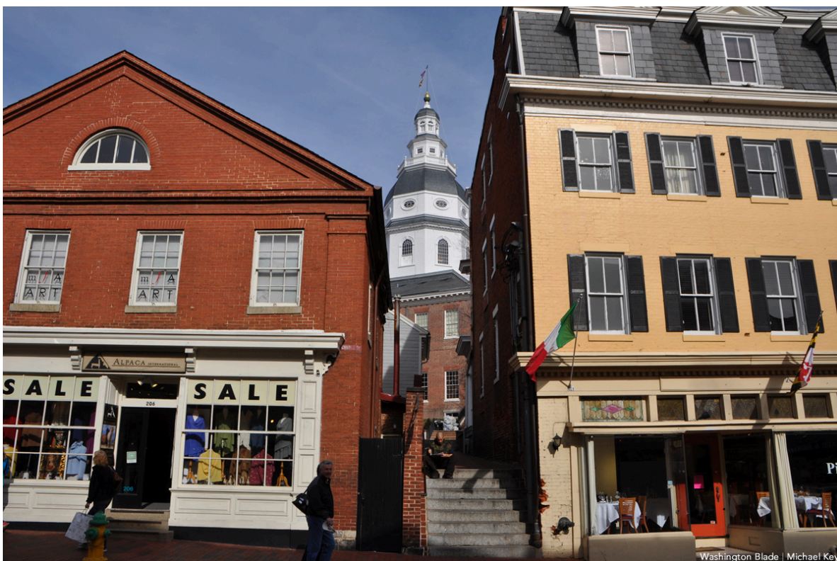
Annapolis, Md.

Next time you need a quick getaway, check out the endless activities in Maryland's charming capital city on the Chesapeake. Check out the famous historical landmarks like the Maryland State House and St. Anne's Church. Explore the plethora of antique shops like Blue Crab Antiques and West Annapolis Antiques. And you can't visit without indulging in seafood dining spots like Cantler's and O'Learys Seafood. There are also several gardens and parks, like Broadneck Park (613 College Pkwy) or the Chase Home Garden (22 Maryland Ave.) where you can unplug and enjoy a stroll.