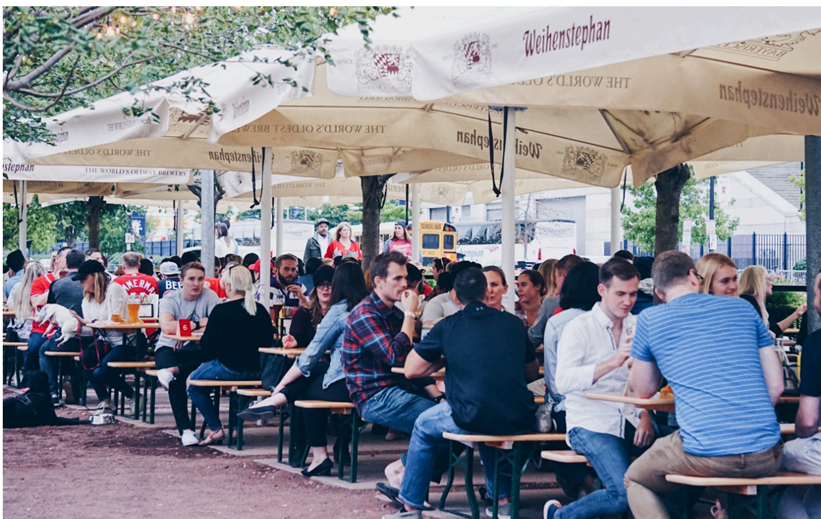
Dacha Beer Garden

The name on everyone's lips when you mention beer is Dacha! This locals favorite has an open plan that makes it easy to guzzle a beer, or two, or three, with family and friends, and meet plenty of likeminded people doing the same. Above all, its menu is affordable with brunch drinks offered at $5 each and weekly eats at $10 each.