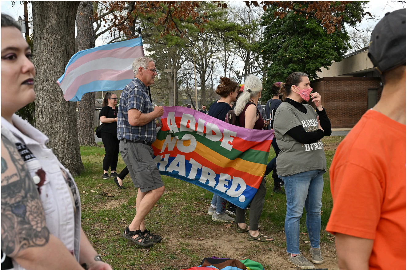
LGBTQ+ supporters carry flags and signs. Scores of LGBTQ+ supporters gathered at the Glen Burnie Library to counter a protest advertised on the Maryland Republican Party Facebook page against a Trans Pride Party to celebrate International Transgender Day of..Visibility hosted by the Anne Arundel County Public Library.