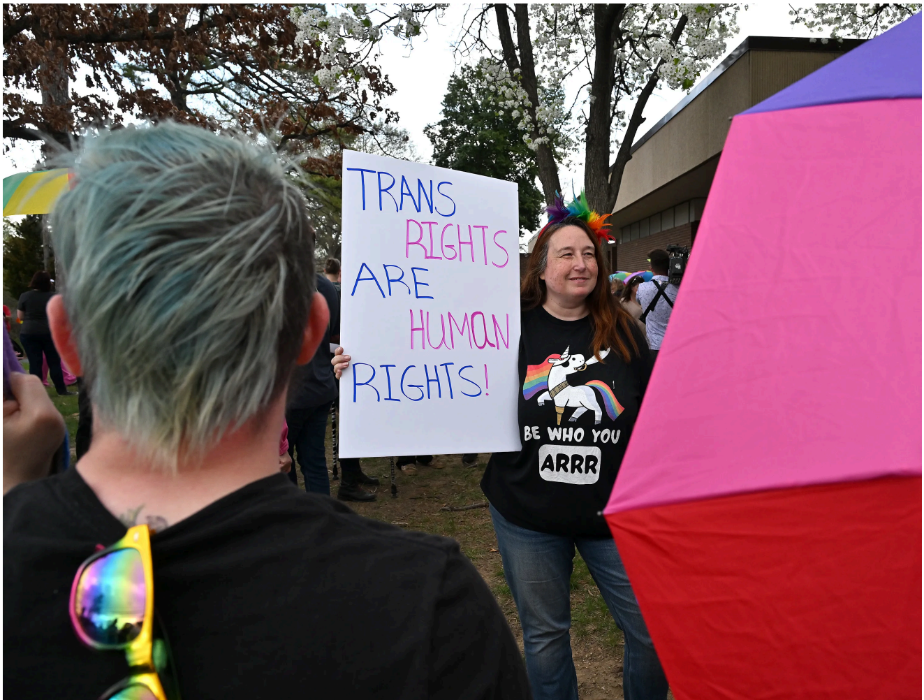
Scores of LGBTQ+ supporters gathered at the Glen Burnie Library to counter a protest advertised on the Maryland Republican Party Facebook page against a Trans Pride Party to celebrate International Transgender Day of..Visibility hosted by the Anne Arundel County Public Library.