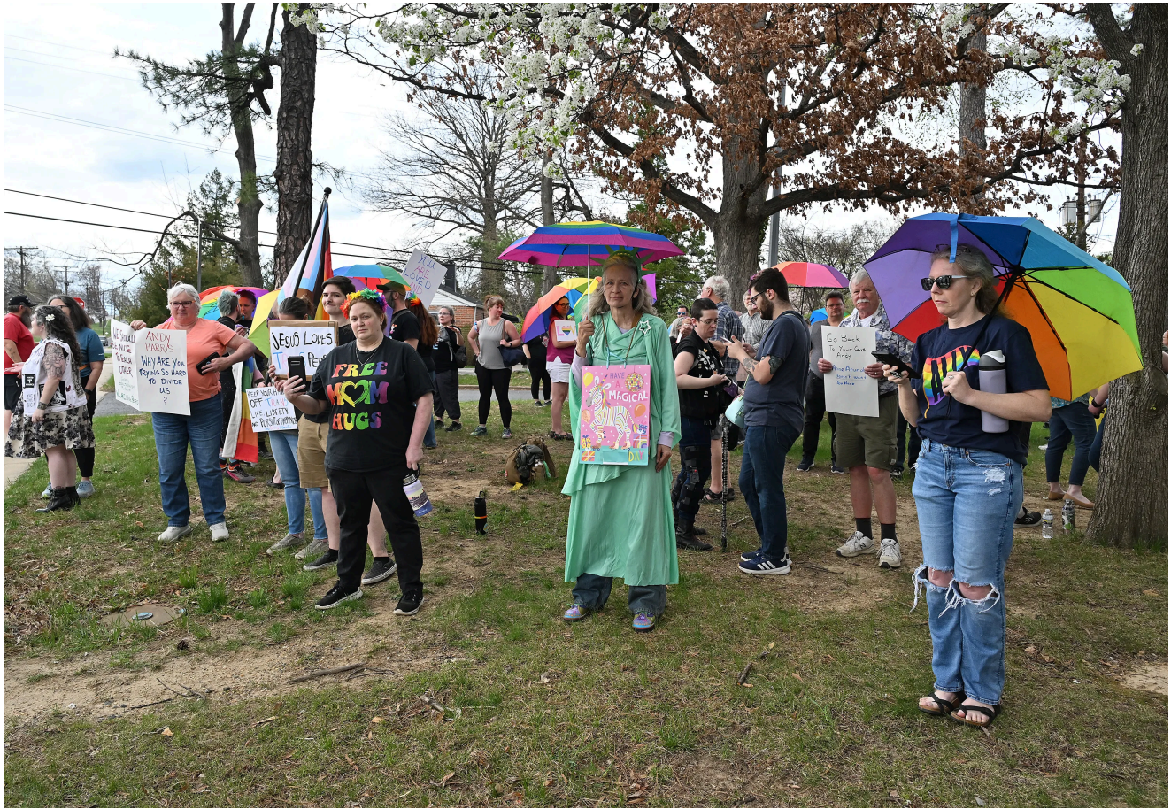
LGBTQ+ supporters. Scores of LGBTQ+ supporters gathered at the Glen Burnie Library to counter a protest advertised on the Maryland Republican Party Facebook page against a Trans Pride Party to celebrate International Transgender Day of..Visibility hosted by the Anne Arundel County Public Library.