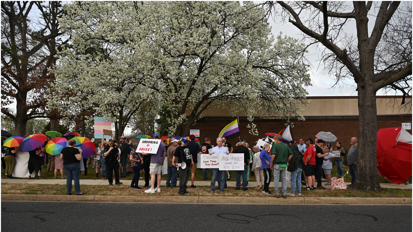
Scores of LGBTQ+ supporters gathered at the Glen Burnie Library to counter a protest advertised on the Maryland Republican Party Facebook page against a Trans Pride Party to celebrate International Transgender Day of..Visibility hosted by the Anne Arundel County Public Library.