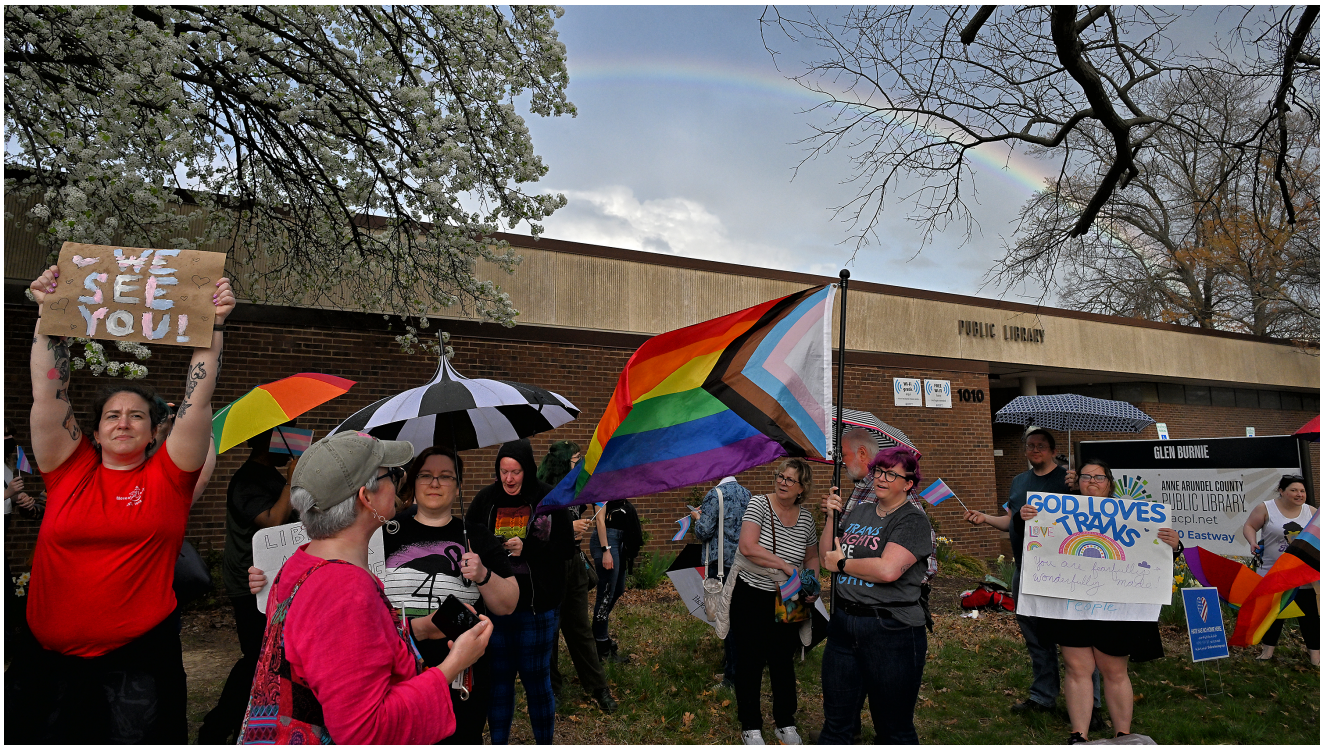
A rainbow breaks through the clouds over the rally at the library. Scores of LGBTQ+ supporters gathered at the Glen Burnie Library to counter a protest advertised on the Maryland Republican Party Facebook page against a Trans Pride Party to celebrate International Transgender Day of..Visibility hosted by the Anne Arundel County Public Library.